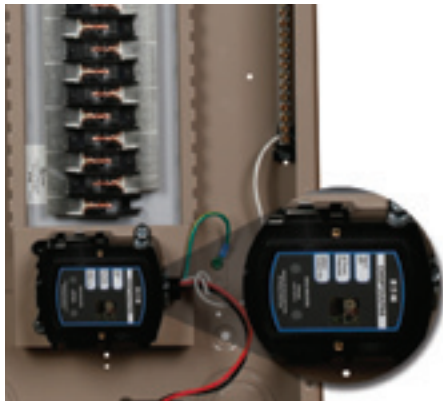
Integral Surge Loadcenter