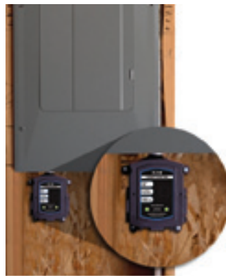
Externally mounted surge protection option