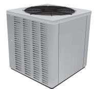
Air Conditioners $4,000