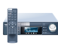
Stereo Systems & Entertainment Centers $1,400