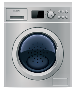
Washers & Dryers $1,500