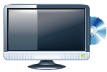
Home Office $1,700