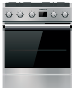
Electric Ranges $1,000